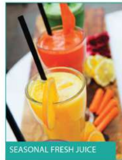
SEASONAL FRESH JUICE

PLAIN NAAN 4 WHOLE WHEAT NAAN 5 KANDHARI NAAN 7 ROGHANI NAAN 7 GARLIC NAAN 7 PURI PARATHA 7 TANDOORI PARATHA 8 CHICKEN QEEMA NAAN 19 MUTTON QEEMA NAAN 21